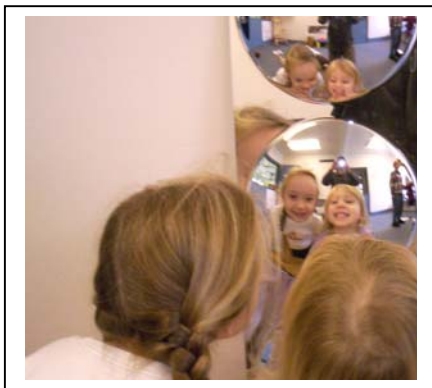
Young admirers of their freshly painted teeth.